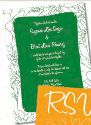
"Waterlily Spring" Wedding Invitation (set of 25) $46.37, RSVP postcard (set of 25) $38.75 by BonMoment