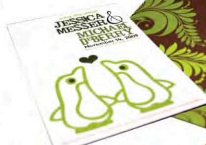
Custom Save the Date Postcard by lizzyandthebean.com "Rachel" Invitation $3, each