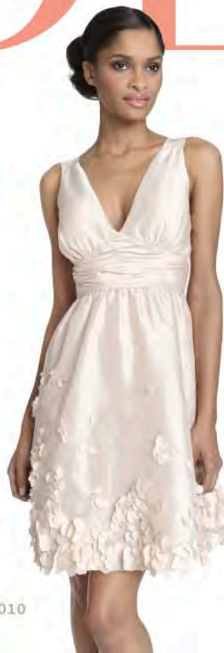
Calvin Klein Petal Appliqué Dress in Ivory $178 nordstrom.com

We've culled from some of our favorites: gowns, shoes, jewels and invites to find you the best and brightest wedding web stars. Ladies, start your mice, click your way to time and money savings, and lower your carbon footprint by flying in the talent.