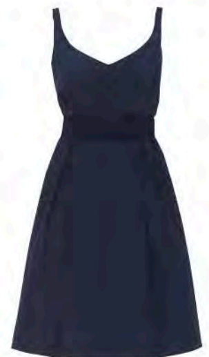
Silk v-neck bridesmaid dress shown in "galaxy" $215, annaylor.com