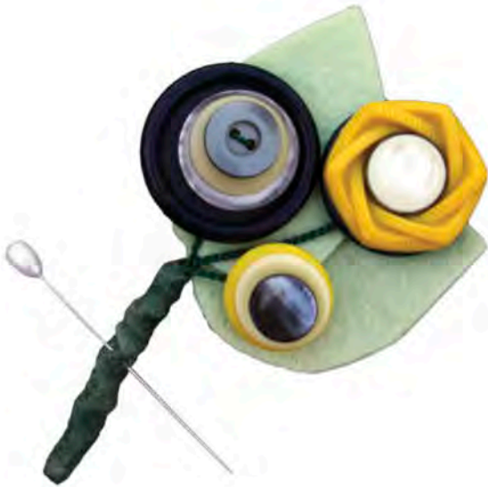
PrincessLasertron.com Vintage felt and button boutonniere, $15 each by princesslasertron.com

PrincessLasertron.com makes floral fantasies in vintage felt and buttons. Her adorable heirloom bouquets, corsages, hair adornments and boutonnieres never wilt, will always bring a smile to your face and are keepers long after W-day.