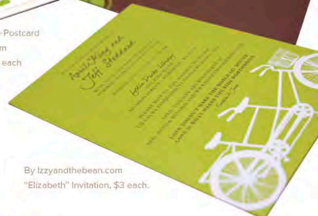
By lizzyandthebean.com "Elizabeth" Invitation, $3 each.