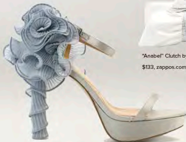
"Anabel" Clutch by Pour La Victoire $133, zappos.com

Zappos.com has the best customer service (and curated shoe picks) in web-land. Bridal lead Hongyee Hoang states, "Current trends in bridal are feminine details such as flower accents and embroidered pearls. We work with our brands to incorporate these trends, as well as prints and ornamentation into the shoes. Brides and bridesmaids seek unexpected pops of color: fuchsia, blue and apple green. With everyone's hectic lives, it's difficult to arrange group-shopping trips, especially if the bridal party lives around the country. If something doesn't work, ship it back on us."