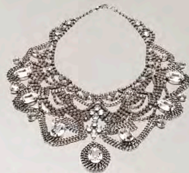
"Ismene" oxidized silver plated array of Swarovski crystals and chain necklace - $745 by dannijo.com