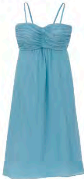
Top: Strapless silk georgette dress in "aqua garden" $185, annaylor.com