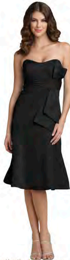
Right: JS Boutique Strapless Satin Dress with Sash in Black, $138, Nordstrom.com