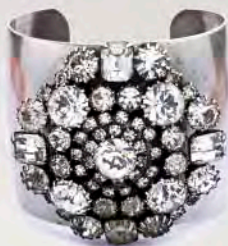
"Anya" Swarovski encrusted cuff - $420 by dannijo.com