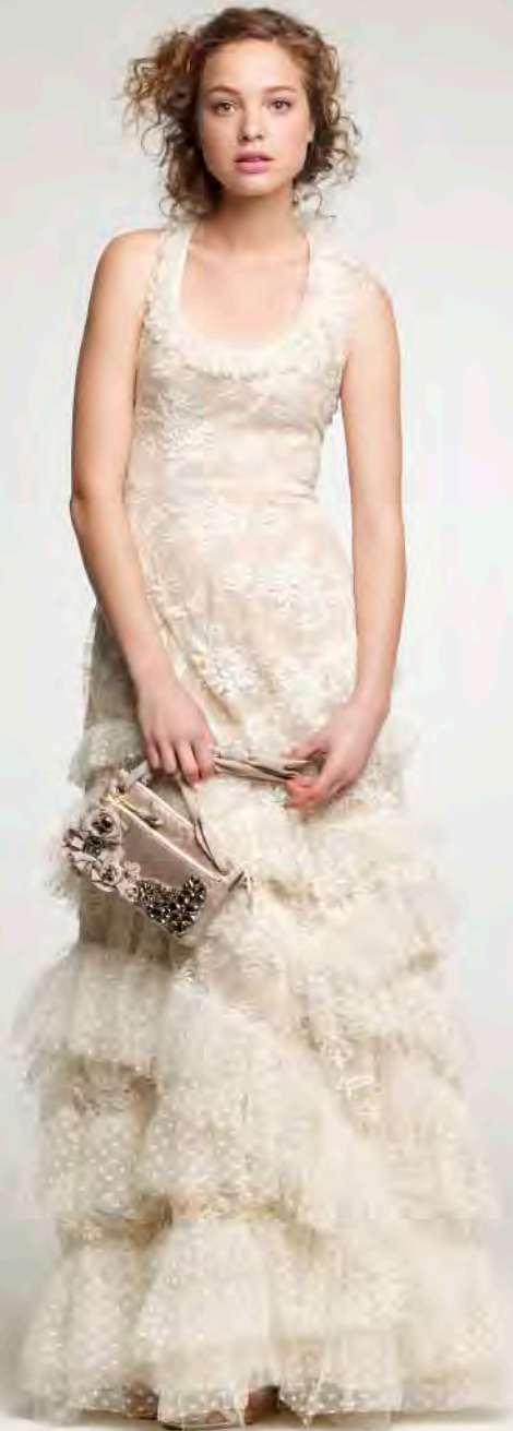
Vintage Lace Gown (29394) by J.Crew - $3,000, jcrew.com

Jcrew.com was the first to hit the catalogues with a rainbow's worth of fantastic dresses for brides and bridesmaids, designing several figure-friendly styles in unified color palettes for a variety of body types. With shoes and bags to match and solutions for the groom, it's a mix and match treasure trove.