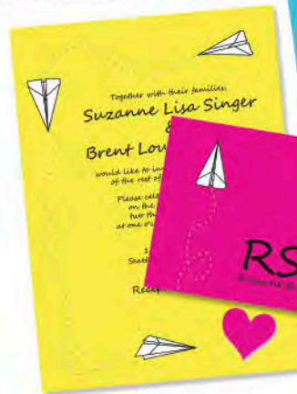
"Paper Airplane" Wedding Invitation (set of 25) $46.37, RSVP postcard (set of 25) $38.75 by BonMoment