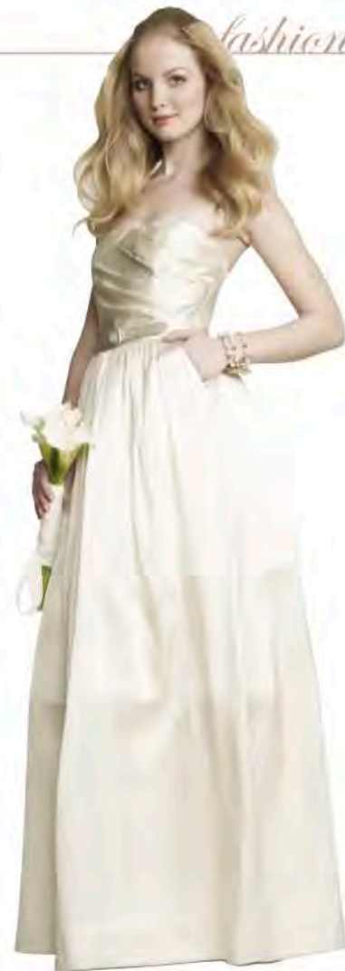
"Romantic" gown by The Limited $298, thelimited.com

Nordstrom.com offers the wedding shop experience online for brides and bridesmaids, from the engagement party all the way to the honeymoon. Brides can call the wedding stylist hotline and start their virtual bridal shopping experience with a Nordstrom Wedding Stylist. The wedding stylist team will cater to the busy ladies in your life (who may reside in a variety of time zones). Nordstrom's online bridal service offers what brides and their attendants need most: advice, solutions and most of all time .